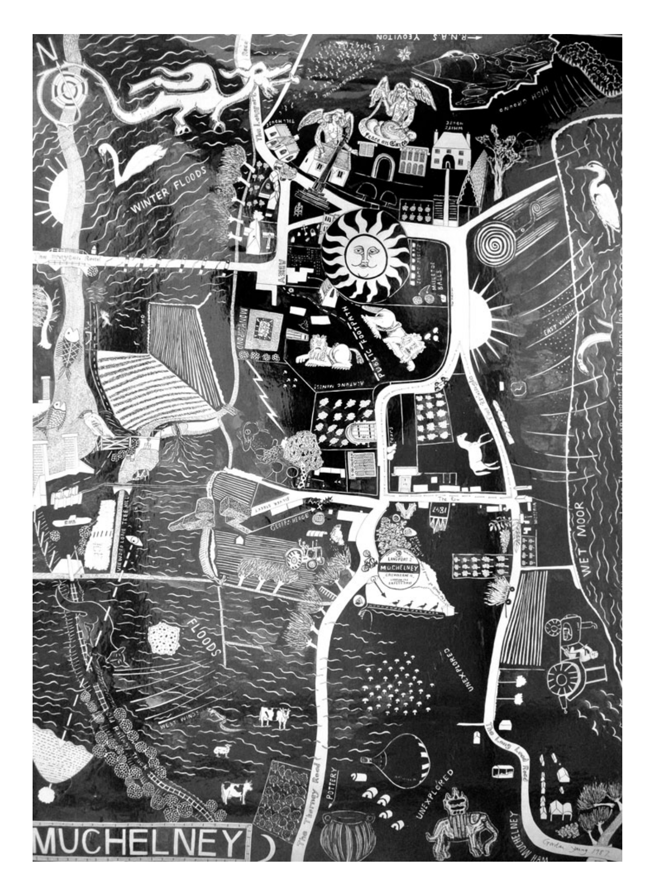
Muchelney, England